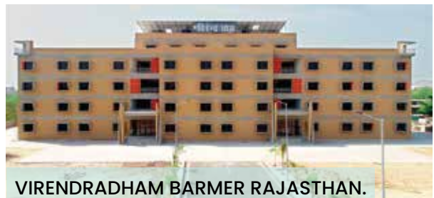
VIRENDRADHAM BARMER RAJASTHAN.