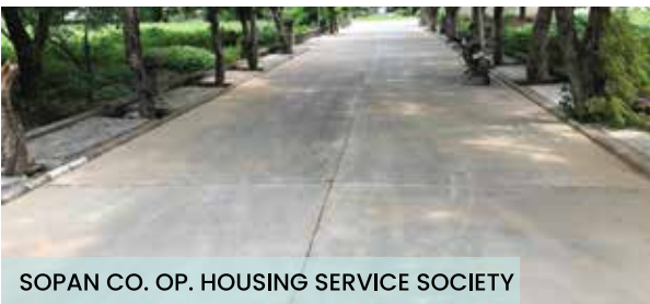
SOPAN CO. OP. HOUSING SERVICE SOCIETY