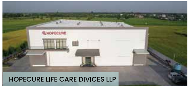
HOPECURE LIFE CARE DIVICES LLP