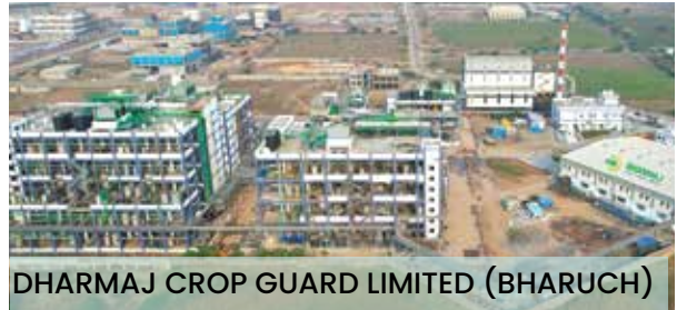
DHARMAJ CROP GUARD LIMITED (BHARUCH)