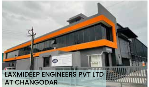
LAXMIDEEP ENGINEERS PVT LTD AT CHANGODAR