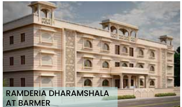
RAMDERIA DHARAMSHALA AT BARMER