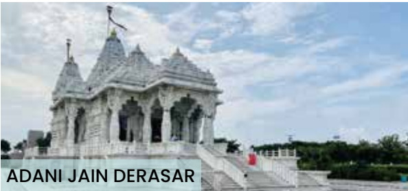
ADANI JAIN DERASAR