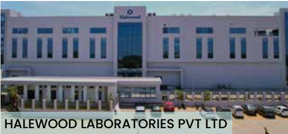
HALEWOOD LABORATORIES PVT LTD