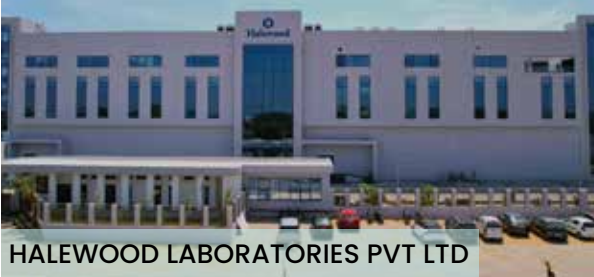
HALEWOOD LABORATORIES PVT LTD