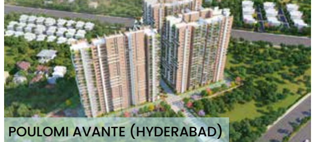
POULOMI AVANTE (HYDERABAD)