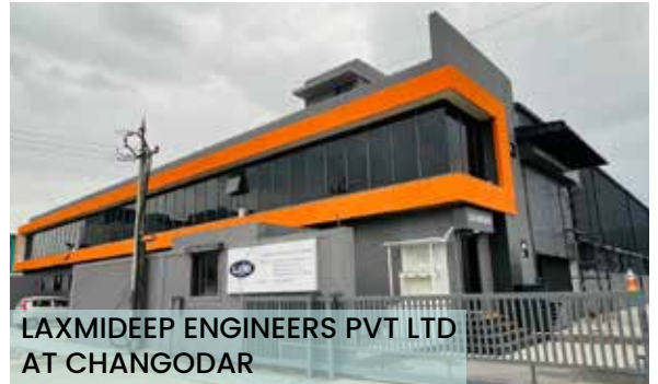
LAXMIDEEP ENGINEERS PVT LTD AT CHANGODAR