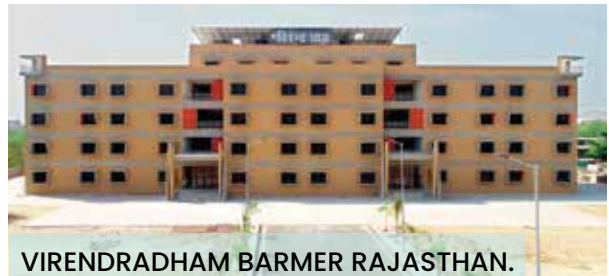
VIRENDRADHAM BARMER RAJASTHAN.