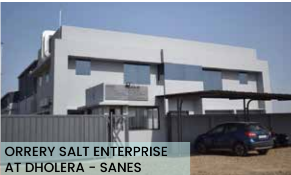
ORRERY SALT ENTERPRISE AT DHOLERA - SANES