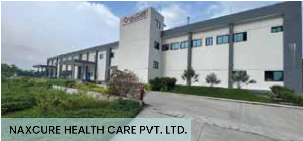
NAXCURE HEALTH CARE PVT. LTD.