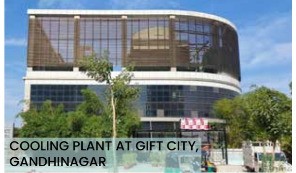
COOLING PLANT AT GIFT CITY, GANDHINAGAR