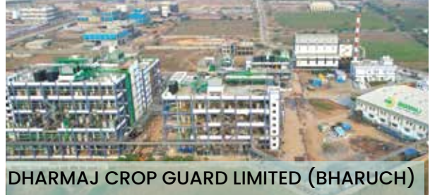
DHARMAJ CROP GUARD LIMITED (BHARUCH)