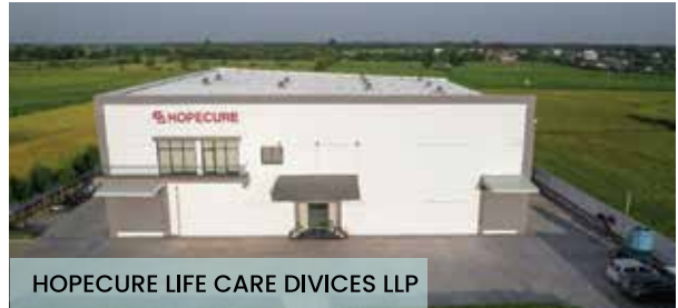
HOPECURE LIFE CARE DIVICES LLP