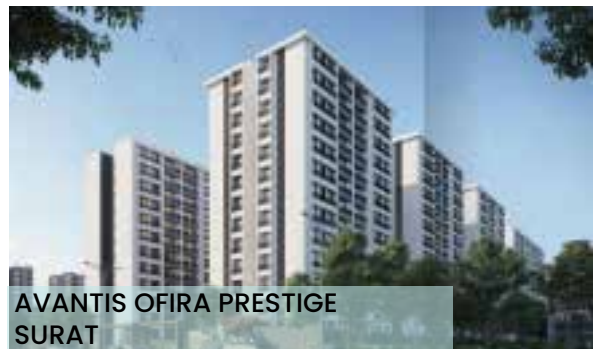
AVANTIS OFIRA PRESTIGE SURAT