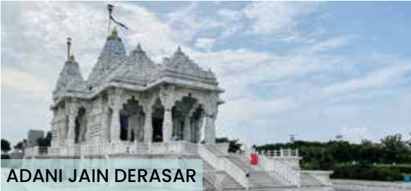
ADANI JAIN DERASAR