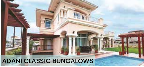
ADANI CLASSIC BUNGALOWS