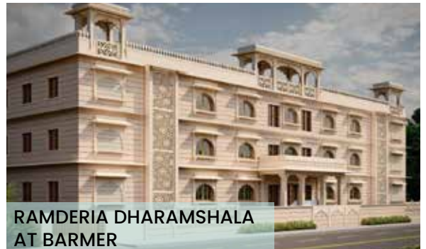
RAMDERIA DHARAMSHALA AT BARMER