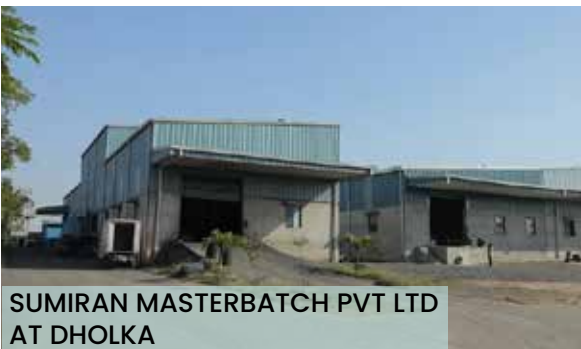
SUMIRAN MASTERBATCH PVT LTD AT DHOLKA