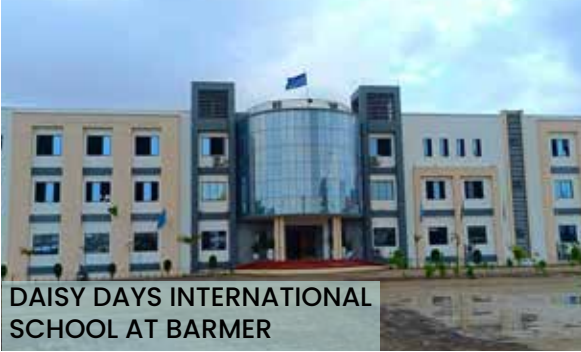
DAISY DAYS INTERNATIONAL SCHOOL AT BARMER