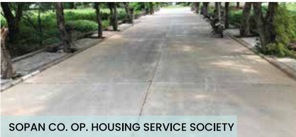
SOPAN CO. OP. HOUSING SERVICE SOCIETY