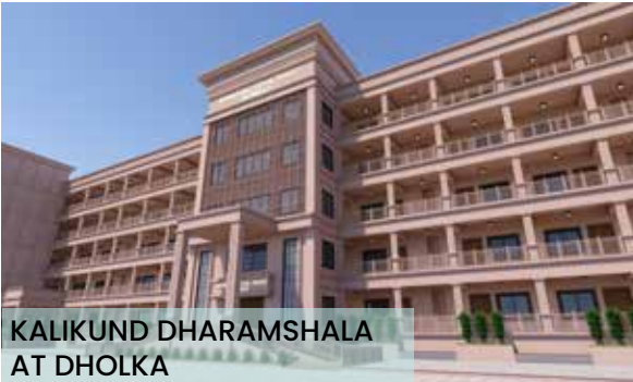
KALIKUND DHARAMSHALA AT DHOLKA