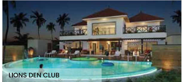
LIONS DEN CLUB